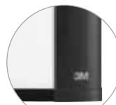
Graphite-Finish Aluminum Frame