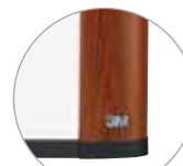
Mahogany-Finish Aluminum Frame