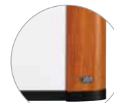
Light Cherry-Finish Aluminum Frame