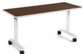
T-LEG Unobstructed leg room (glides or casters)