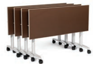
NESTING BASE Space-efficient storage (casters only)