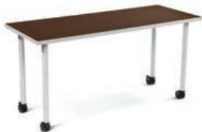
POST LEG Sturdy and affordable (glides or casters)