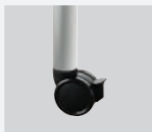
POST LEG CASTER Available on 24" and 30" D tables only.