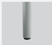
POST LEG GLIDE