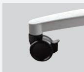
NESTING BASE/ T-LEG CASTER