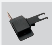
POWER ENTRY PLATE