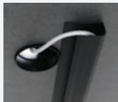
WIRE MANAGEMENT STRIPS

The nesting base allows for space-efficient table storage. The dampened articulation of the hinge mechanism lets the tabletop fold down safely and softly. Modesty panels drop down and out of the way when tables are nested.