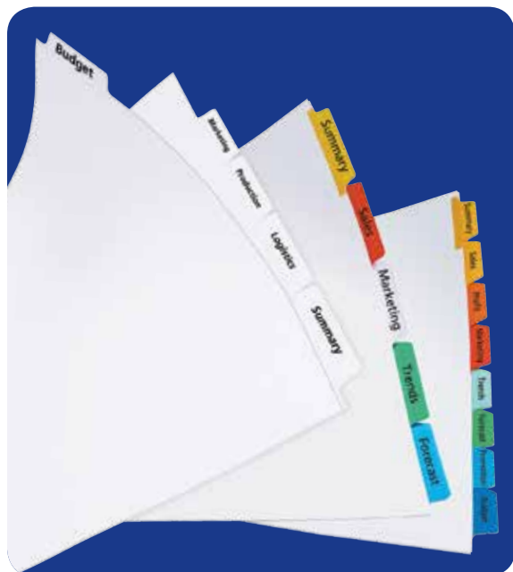
Index Maker® Clear Label Dividers