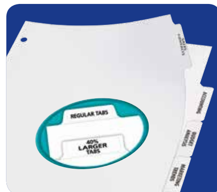
Index Maker® Big Tab™ Clear Label Dividers