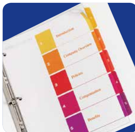
Ready Index® Multicolor Table of Contents Dividers