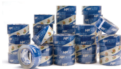
1288647 HP260C 1.88" x 60yd 36/CA