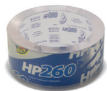
HP260C 1.88" x 60yd