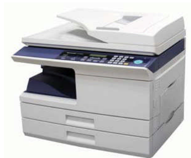
Models: AL-2030, AL-2040CS, AL-2050CS

This offer may not be combined with any other rebate & does not apply to purchases at Staples, Staples.com or membership warehouse clubs