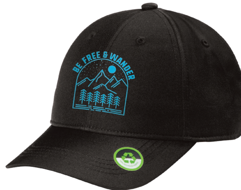
Port Authority® Eco Cap C954 | 4 colors