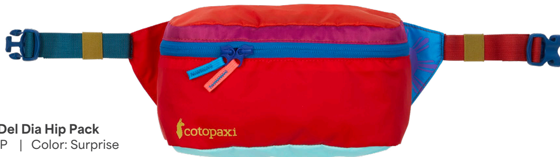
Cotopaxi Del Dia Hip Pack COTODDFP | Color: Surprise