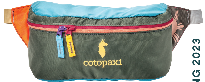
Cotopaxi Bataan Hip Pack COTOBFP | Color: Surprise