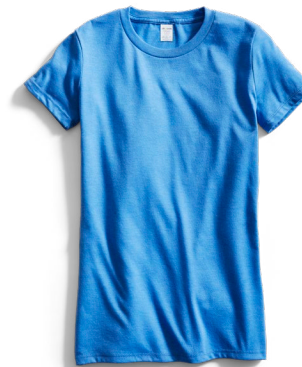
FREE Allmade® Youth Tri-Blend Tee AL207 | Youth Sizes: XS-XL | 7 colors