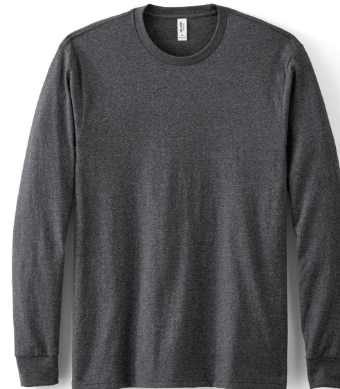
Allmade® Unisex Long Sleeve Recycled Blend Tee AL6204 | Unisex Sizes: XS-4XL | 3 Colors