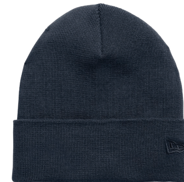
New Era® Recycled Cuff Beanie NE907 | One Size Fits Most | 3 colors