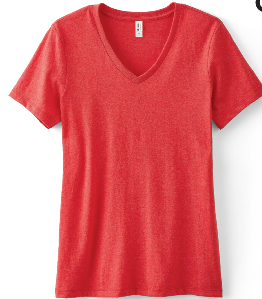
Allmade® Women's Recycled Blend V-Neck Tee AL2303 | Women's Sizes: XS-4XL | 4 Colors